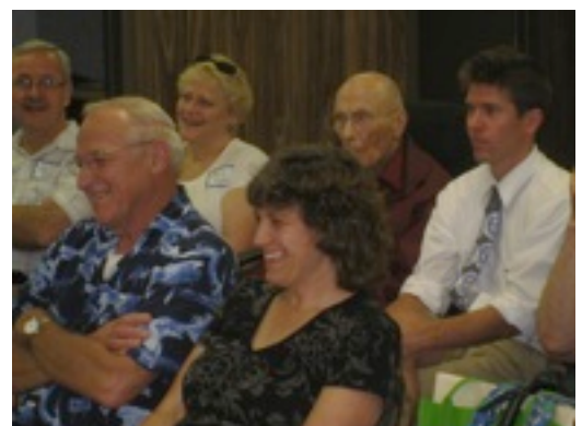
Open House Dedication

His Wheels International P.O. Box 423 Wheaton, IL 6018(630) 510-1005