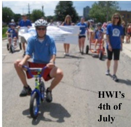
HWI’s 4th of July

My husband loved to ride his bike, and I have been looking for an opportunity to donate it to someone who could really use it. I would love to give it to His Wheels.”