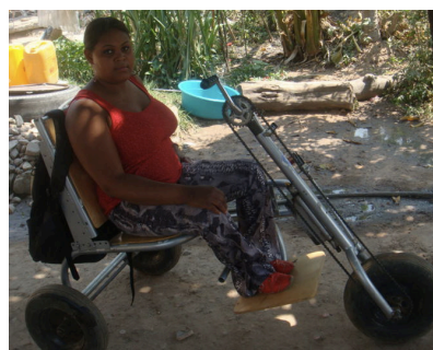
A school teacher in Angola, Africa, paralyzed by polio at age 7, used to crawl to her classroom.