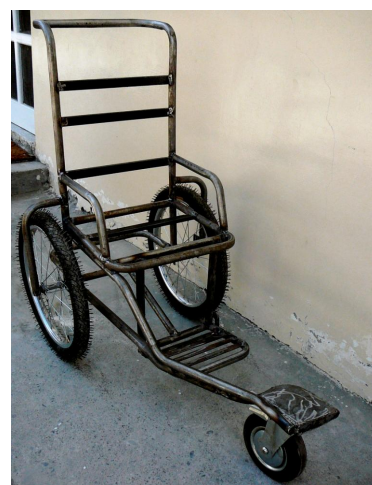
Trike designed by HWI and built in Pakistan. Local materials and manufacturing were used.