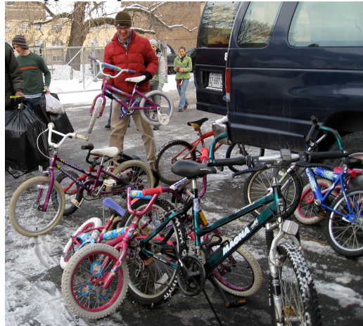
Bikes distributed in Chicago for Christmas