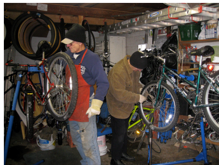
Over the winter, three to six mechanics "wrench" on bikes every week.

Thanks to everyone who contributed to our end of the year drive. With a $5,000 match from a generous donor, contributions to HWI totaled over $23,000 for 2007. Another $2,000 from bike sales and other income rounded out HWI's 2007 income to over $25,000. Since our inception, over 200 volunteers have donated more than 3,000 hours. I am also excited to inform you that our donor base doubled last year. The executive board has approved a budget of $50,000 for 2008 to support our expanding national and international bicycle and tricycle ministries.