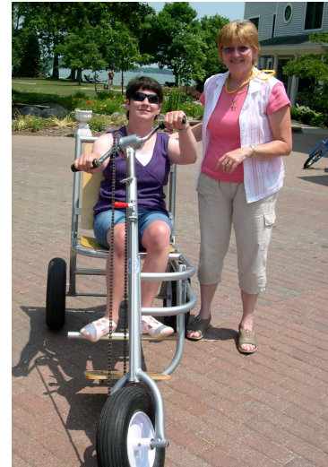
HWI trike at Joni and Friends retreat

like to have an HWI representative speak at your organization or event, please contact us.